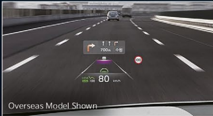
Head Up Display (GT-Line)