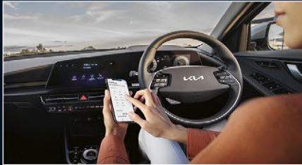
Kia Connect 17 (GT-Line)