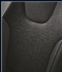
Charcoal - Artificial Leather (GT-Line)