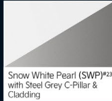
Snow White Pearl (SWP) #23 with Steel Grey C-Pillar & Cladding