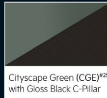
Cityscape Green (CGE) #25 with Gloss Black C-Pillar