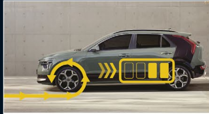
Smart Regenerative Braking