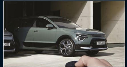
Remote Smart Park Assist (RSPA) WA (GT-Line)