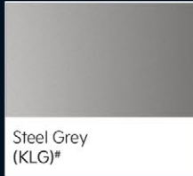
Steel Grey (KLG) #