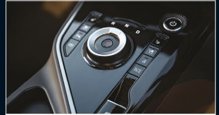
Shift-By-Wire Rotary Dial (HEV GT-Line & EV)