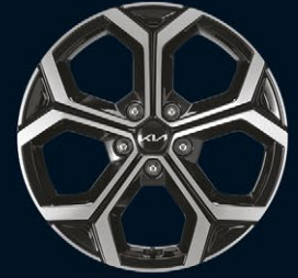
18" Alloy (HEV GT-Line)