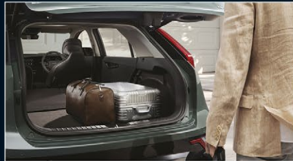
Hands-free Smart Power Tailgate (GT-Line)