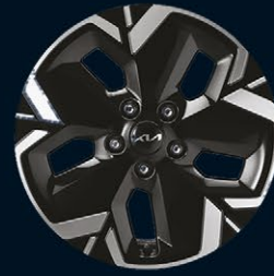
17" Alloy (EV Standard)