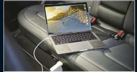
Vehicle to Load Interior Socket (EV Standard)