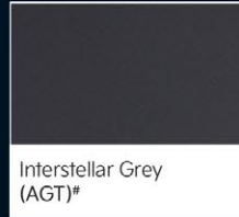
Interstellar Grey (AGT) #