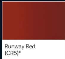
Runway Red (CR5) #