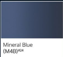
Mineral Blue (M4B) #24