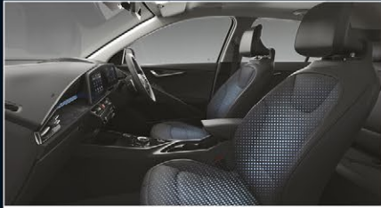
Heated & Ventiladed Seats (GT-Line)