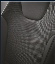
Charcoal - Partial Cloth & Artificial Leather (S)