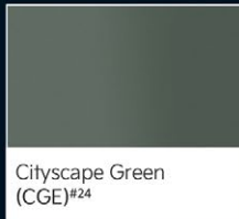
Cityscape Green (CGE) #24