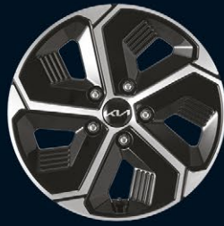
16" Alloy (HEV Base S)