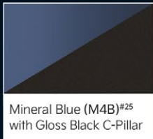
Mineral Blue (M4B) #25 with Gloss Black C-Pillar