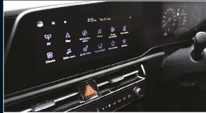
Dual 10.25" (Infotainment Touch Screen + Driver Cluster) (GT-Line)