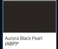
Aurora Black Pearl (ABP) #