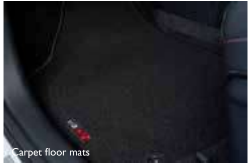
Carpet floor mats