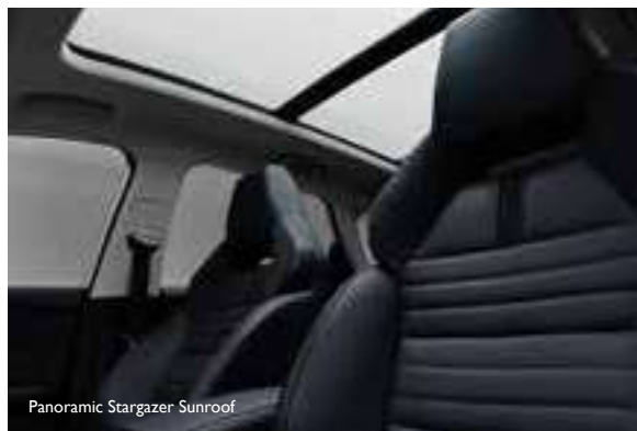
Panoramic Stargazer Sunroof