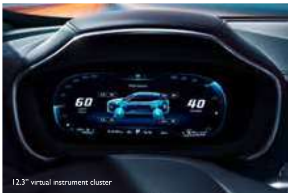
12.3" virtual instrument cluster