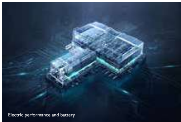
Electric performance and battery