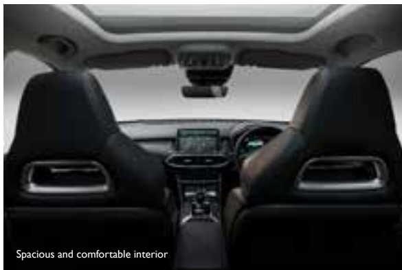
Spacious and comfortable interior