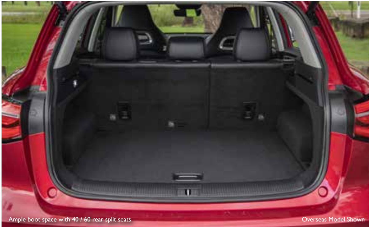
Ample boot space with 40 / 60 rear split seats

The powerful 2.0L Turbo engine is ideal for reactive driving in urban environments as well as navigating those longer rural road trips. In addition, the premium Michelin tyres are also adaptive to both city and country terrain, ensuring uncompromised performance on and off the beaten track.