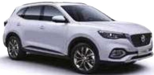
NEW PEARL WHITE METALLIC

Brighten your drive with our range of expressive MG HS colours. Choose from our considered selection of bespoke shades in both metallic and non-metallic options