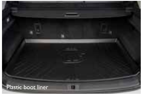
Plastic boot liner