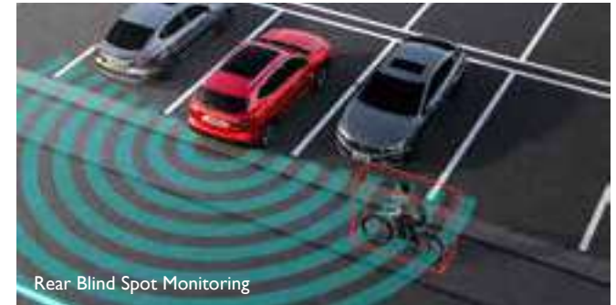
Rear Blind Spot Monitoring

The above safety features are driver assist technologies that are not a substitute for safe and attentive driving or for the drivers control over the vehicle.