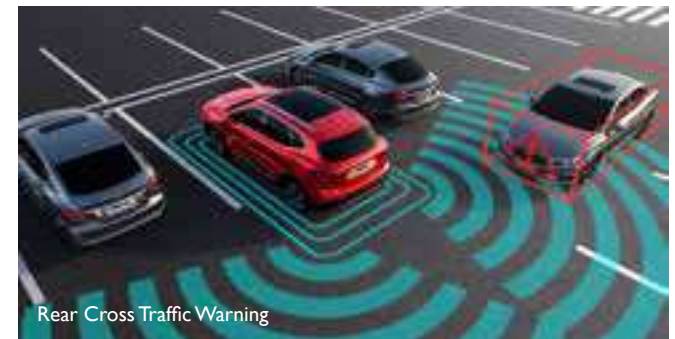
Rear Cross Traffic Warning