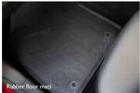
Rubber floor mats