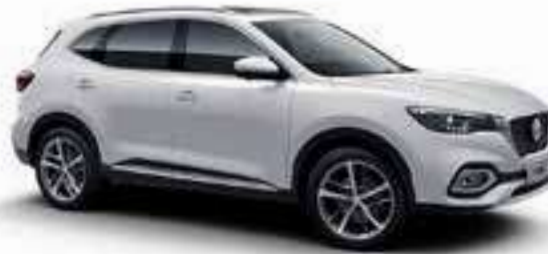
YORK WHITE NON METALLIC