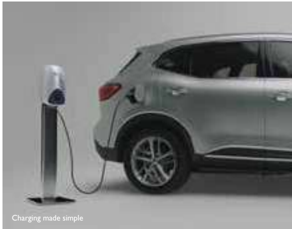
Charging made simple