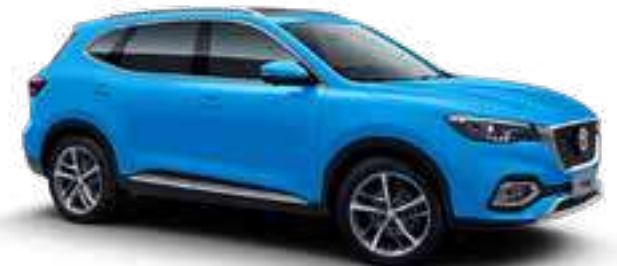
BRIXTON BLUE METALLIC