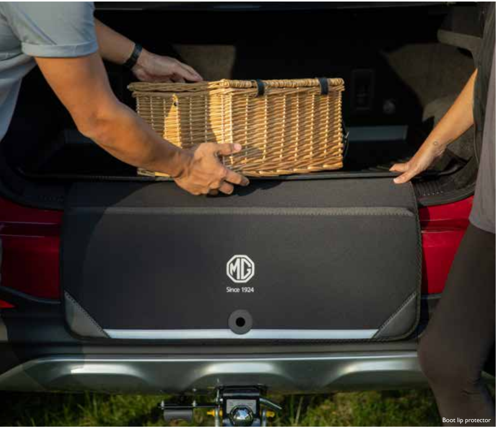
Boot lip protector