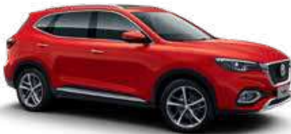
DIAMOND RED METALLIC