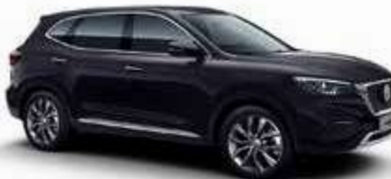
BLACK PEARL o METALLIC