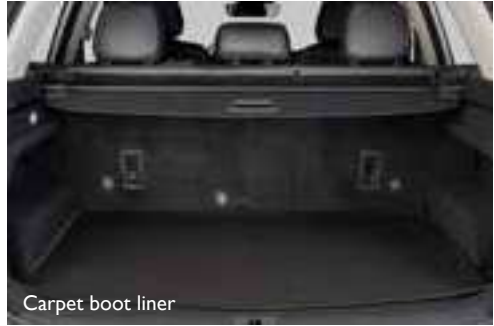
Carpet boot liner