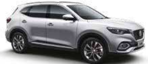
STERLING SILVER METALLIC