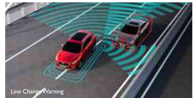
Line Change Warning